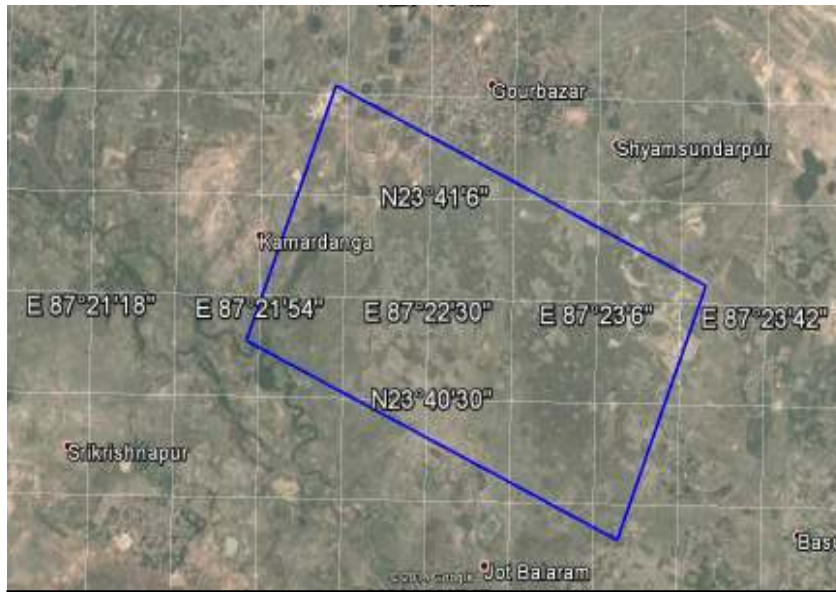
AREA-1A; Rangamati Block, West Bengal