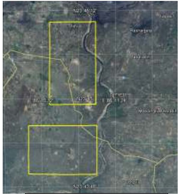
AREA-1B; Radhanagar, Jharkhand